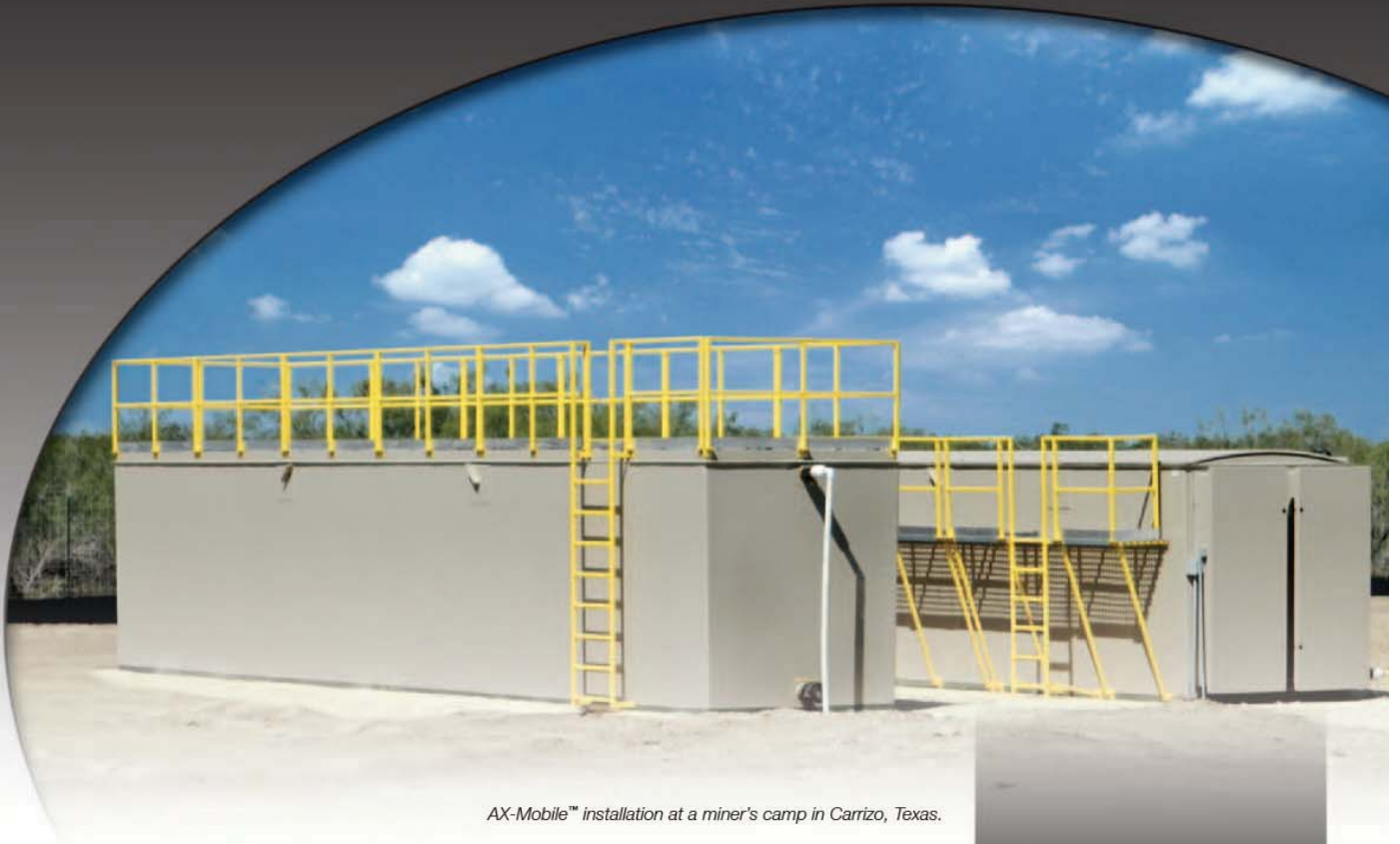
AX-Mobile™ installation at a miner's camp in Carrizo, Texas.